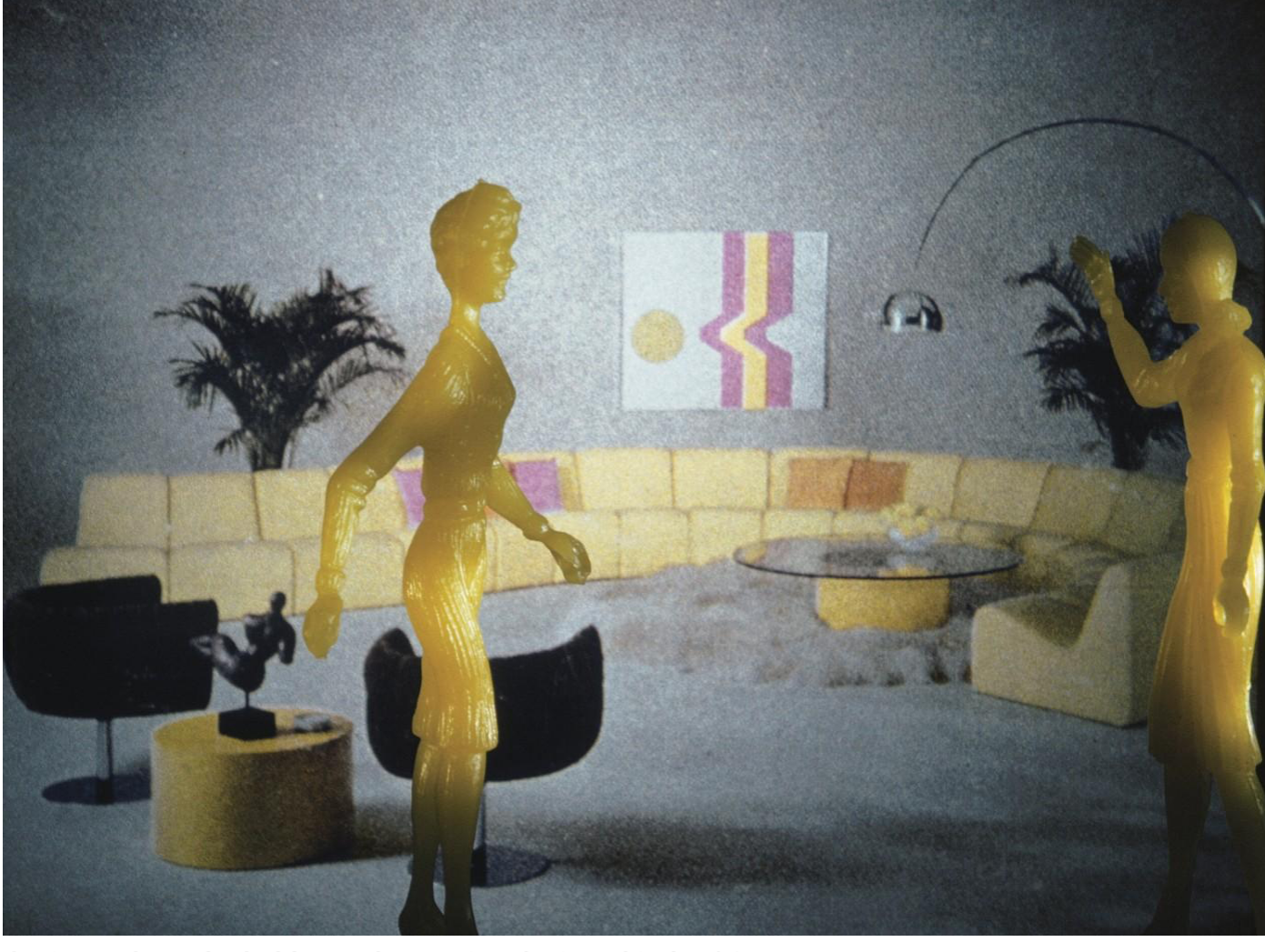
Laurie Simmons, Yellow Living Room, 1982

Opening this week at the Museum of Contemporary Art, Chicago is the first major survey of acclaimed photographer Laurie Simmons. Laurie Simmons: Big Camera/Little Camera encompasses four decades of her work, including film and sculpture, in addition to her photographs. Known for her close-up images of the world of dolls, Simmons has long used her lens to critique gender roles and idealized visions of American prosperity and domesticity. By making small objects the central focus of her works, Simmons manipulates our sense of scale and of what is important and worthy of artistic attention. In this way, Simmons makes the personal, the small, and the intimate, political objects,