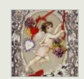
The History of the Heart Shape