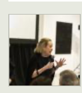
Rosa de la Cruz, Star of the Miami Art Scene, Dies at 81